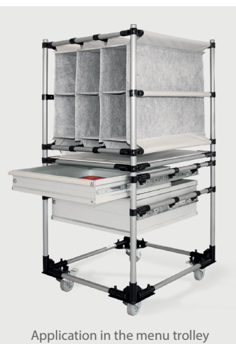
Application in the menu trolley