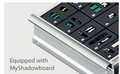
Equipped with MyShadowboard