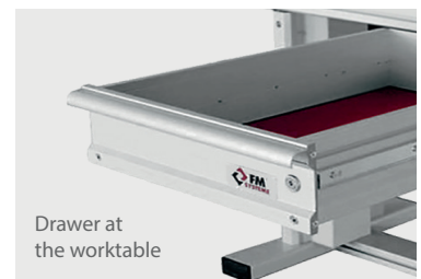
Drawer at the worktable